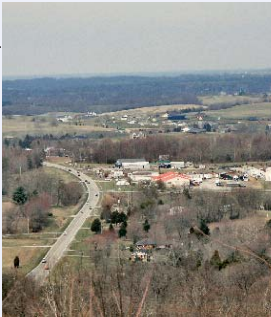
The Halls Gap Overlook, five miles south of Stanford, is the highest point in the Bluegrass region. One can see Mercer, Garrard, Boyle, Jessamine and Lincoln counties.

One of Kentucky's three original counties, Lincoln County was founded in 1780 and originally comprised about one-third of the state. Much smaller today, at 336 square miles, it is known as Kentucky's "Land of Firsts."